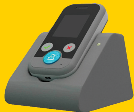
IntelliCare and Pearl II are trademarks of Oysta Technology Ltd

IntelliCare puts measures in place to limit risk and to summon assistance if necessary. Enabling families, carers and social care professionals to trace or track a VIP when there is a real concern they could go missing, IntelliCare provides everyone within the VIPs care network with the means to locate the missing person quickly and safely.